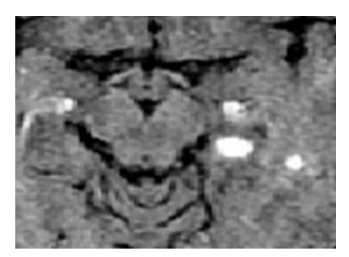
Figure 3: Acute left hippocampal lesion.

netic field strength 1.5 T as compare to higher sensitive MR imaging using high field strength 3T.<sup>9-11</sup>