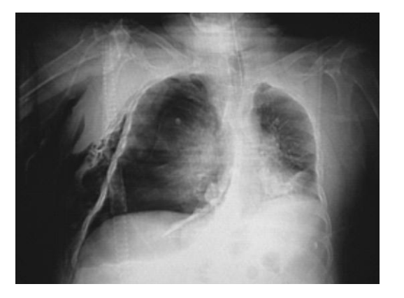
Figure III. Right sided Tension Pneumothorax in a patient with positive pressure ventilation