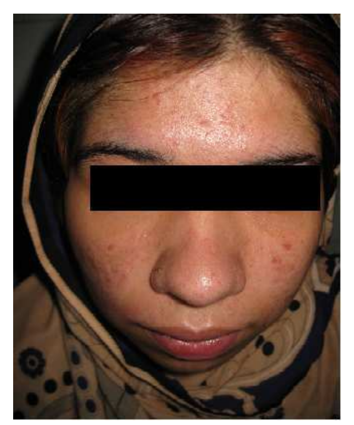
Fig. 1b: Lesions reduced after treatmet