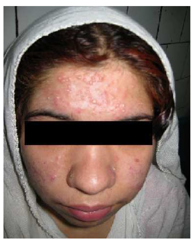
Fig. 1a: Papulopustular lesions before treatment

Acne vulgaris is a common disorder affecting nearly 80% of individuals between the ages of 12-24 years. While acne does not affect health overall, its impact on emotional well – being can be critical and is associated