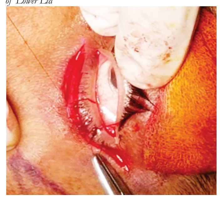
Figure 1d: Wound Closure in Layers