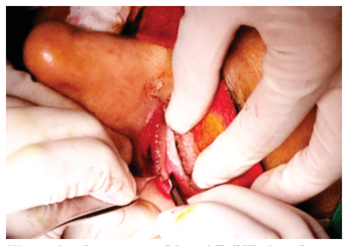
Figure 1a: Intra-operative View of Full Thickness Incision on Posterior Lamella (Kuhnt-Szymanowsky)