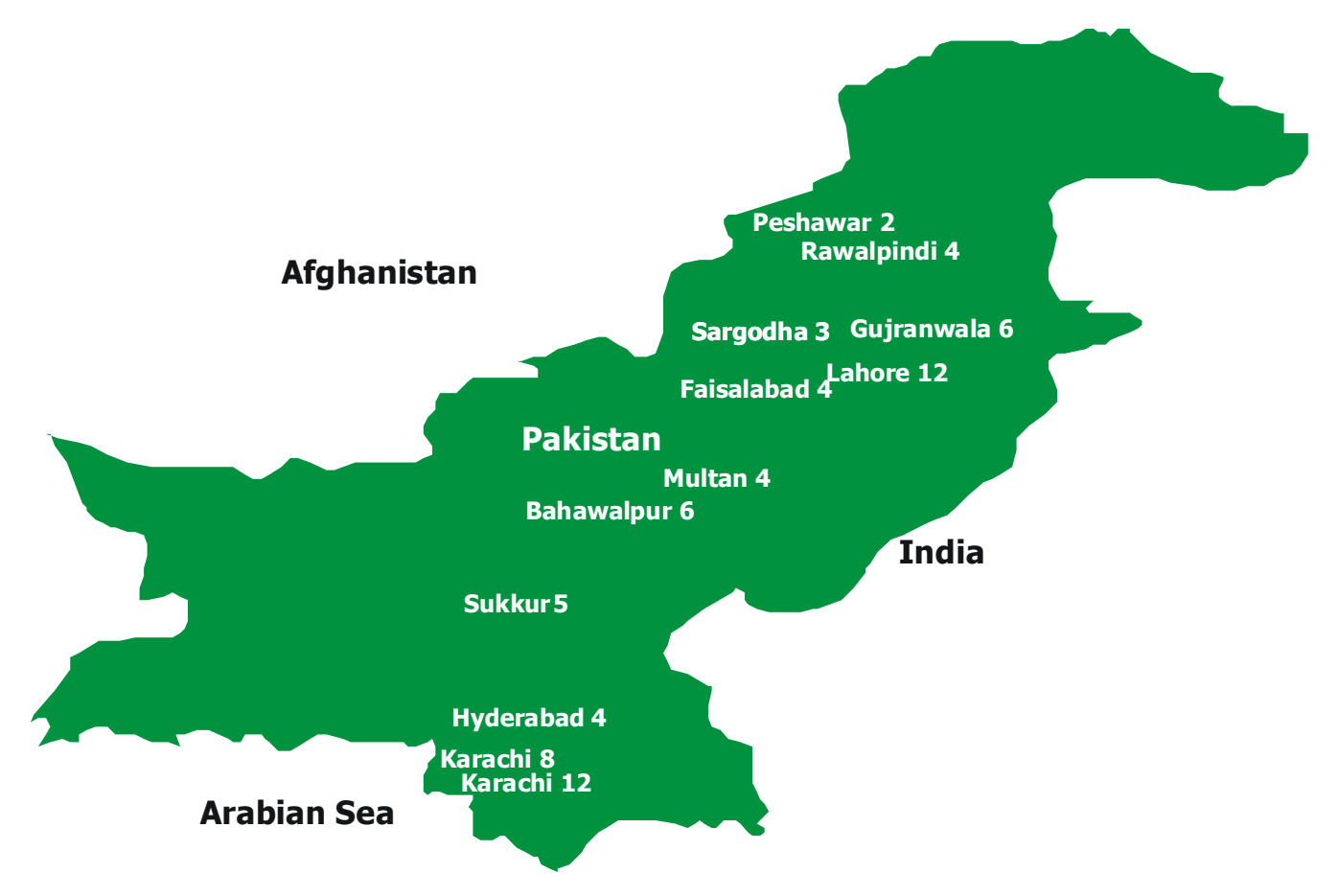
Figure 2: Location of centers (Numeric represent the number of sites per city).