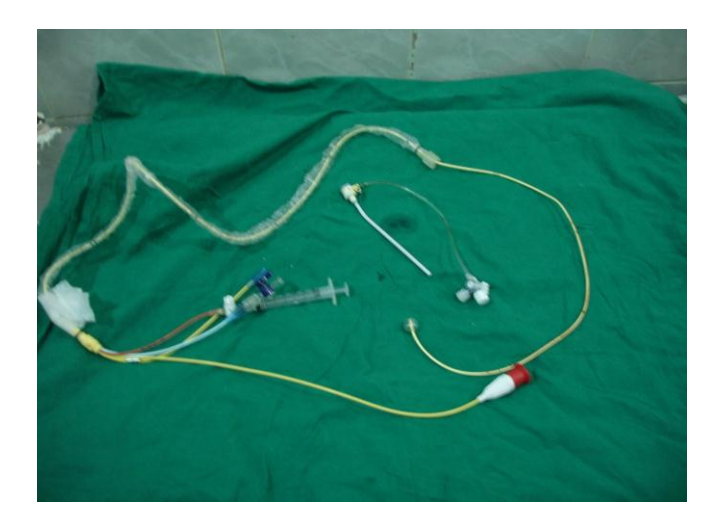
Fig. 1: Swan Ganz Catheter and its Sheath. sions regarding start of milrinone infusion for pulmonary hypertension. The right atrial pressure was 2 mm. Hg and pulmonary artery pressure was 30/12 mm. Hg. She was given IV fluids and inotropes were stopped. She again started passing high volumes of urine. Her serum sodium was 155 mmol/L and urine specific gravity was 1002. Provisional diagnosis of Diabetes Inspidus was made. She was treated with desmopressin nasal spray and her urine output slowly lessened. She was treated with desmopressin for 03 days and then stopped. She made good recovery and was discharged

The basic aim of swan ganz catheter insertion was to check pulmonary artery pressures and make deci-