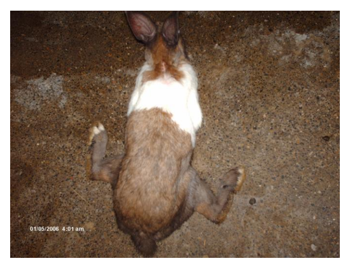
Fig. 1: Manifestation of paraplegia in group IV(a+b) rabbits.