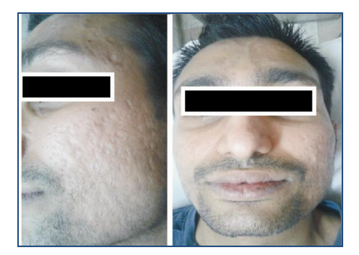
Fig. 2a: Before (Severe Acne Scars).