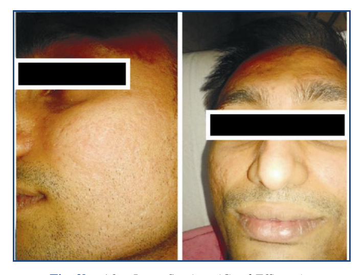
Fig. 2b: After Laser Sessions (Good Efficacy).

The laser parameters like energy, density and depth of ablation was adjusted at each session, according to the severity of acne scars and patient's skin type. Fluence (energy pulse) varied from 15 mJ/cm2 to 24mJ/cm2, density level of 2 to 4 and depth level of 3-7 were used.