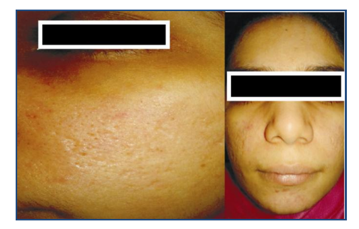
Fig. 1b: After Laser Sessions (Good Efficacy).