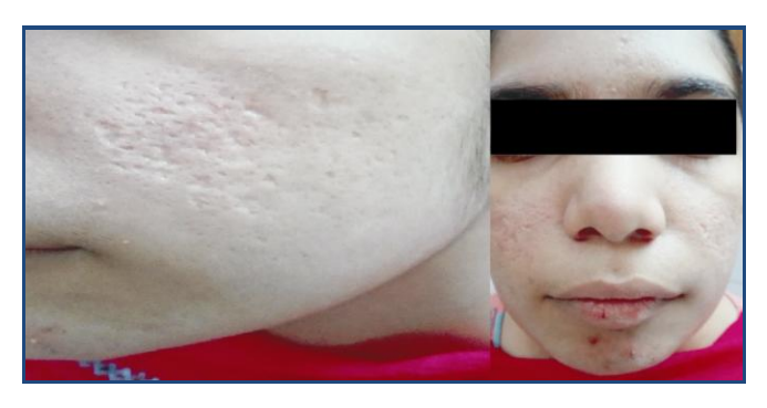
Fig. 1a: Before (Severe Acne Scars).

23 (76.7%) patients were in the age range of 18 - 25 years while 6 (20%) were of 26-35 years of age and 1 (3.3%) patient was 37 years old. In this study, 14 (46.7%) patients showed good efficacy (50 - 75% reduction), same number of patients showed fair efficacy (25 - 50% reduction) and 1 (3.3%) patient came out with excellent efficacy i.e. > 75% reduction in acne scars.